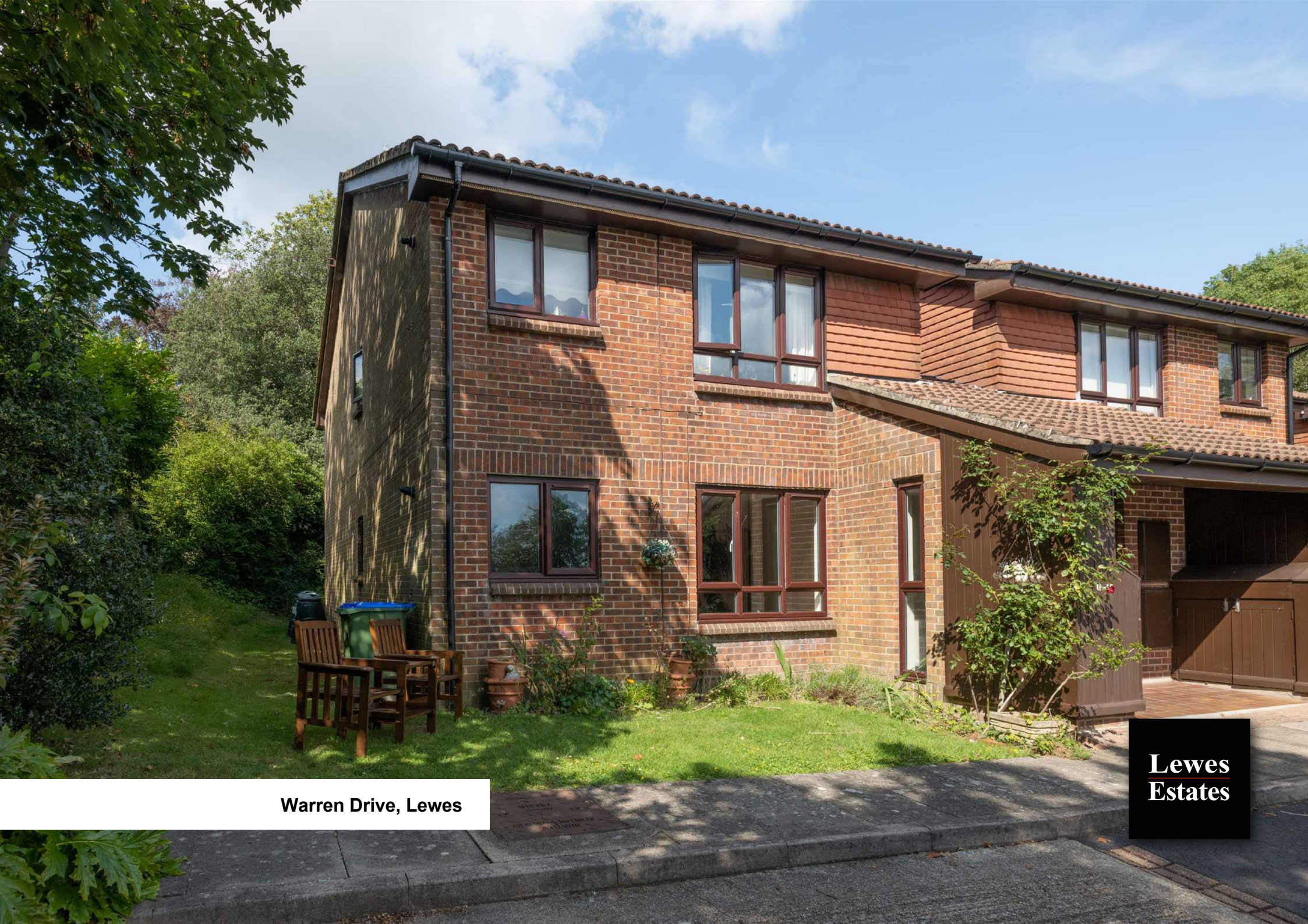
Warren Drive, Lewes